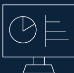
KPMG technology (Trust Tax Engine)

We are passionate about bringing value beyond the fees for our services. Our clients benefit from the following complimentary services: