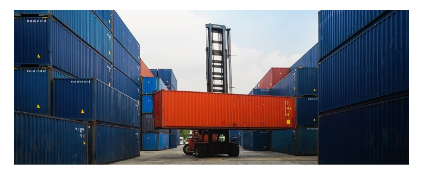
©2024 KPMG, an Australian partnership and a member firm of the KPMG global organisation of independent member firms affiliated with KPMG International Limited, a private English company limited by guarantee. All rights reserved. The KPMG name and logo are trademarks used under license by the independent member firms of the KPMG global organisation.

Intensifying geopolitical tensions mean that disruptions to energy markets are increasingly likely in the years ahead. For example, the Asia-Pacific region includes multiple areas that several countries lay claim to. Some of these contested areas could erupt into conflict, with varied and complex implications for Australia. In the South China Sea, at least seven East and Southeast Asian countries have competing claims to islands and exclusive economic zones.<sup>47</sup> As the balance of power shifts and rising powers are more willing to challenge the status quo, one or more countries in that region could spark conflict to stake territorial claims. Even if Australia is not drawn into such a conflict, the impacts on our ability to export and import could be significant. A significant proportion of Australia's seaborne trade passes through the South China Sea, 48 so any deterioration in the security environment will impact retailers' ability to import goods to sell, and to service overseas customers.