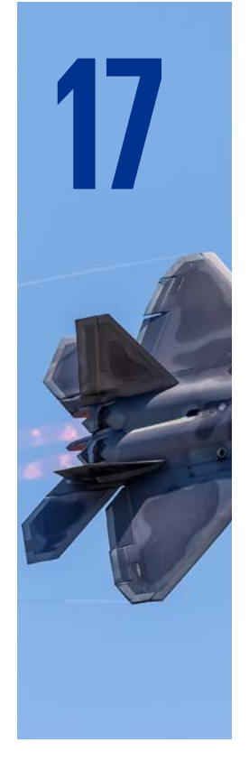
Opportunities to accelerate