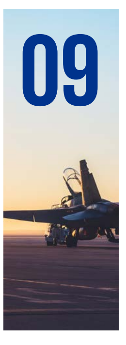
Advancing to the horizon