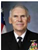
William J. Fallon

Retired Four-Star Admiral, U.S. Navy Former Commander, U.S. Central Command